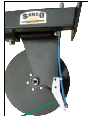
(notched disc removed)

pivot allows NutriMate 3™ to flex independently of planter row unit.